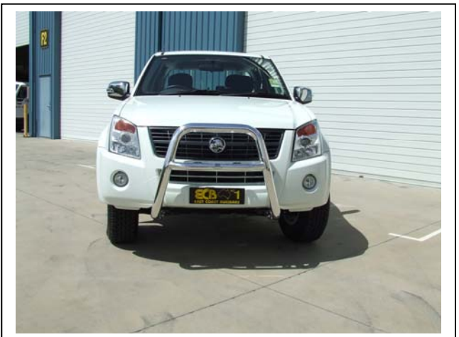
Figure 7 – RA7 63mm Series 2 front view Nudge Bar shown