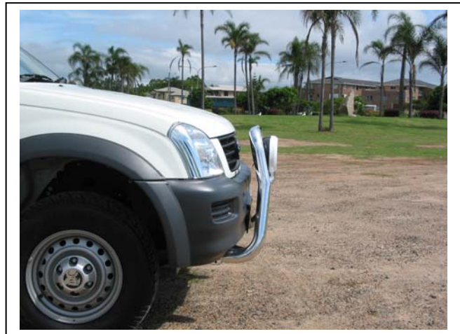
Figure 6 – RA 63mm Series 2 Nudge Bar side view shown