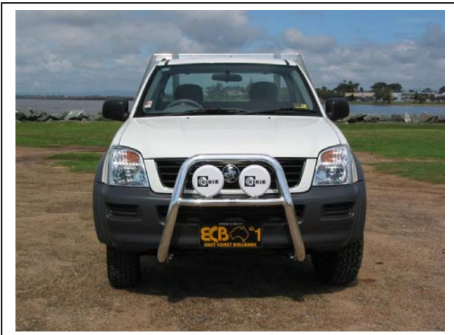
Figure 5 – RA 63mm Series 2 Nudge Bar front view shown