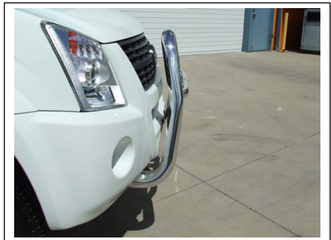
Figure 8 – RA7 63mm Series 2 Nudge Bar side view shown